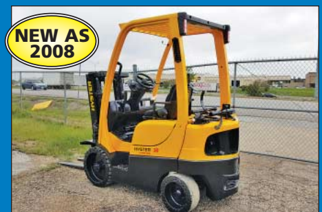
(3) 3,000 LB Hyster Model H30FT LP Gas Solid Tire Lift Trucks