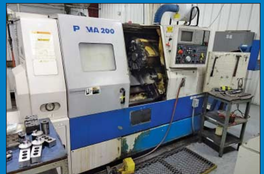
Daewoo Model Puma 200C CNC Turning Center