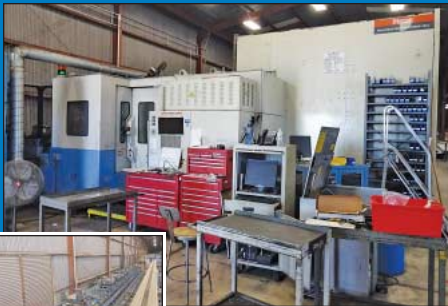
(2) Mazak Model H630-5X CNC Horizontal Machining Centers