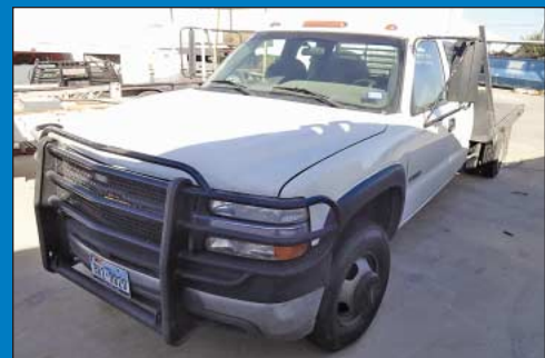
Chevy 3500 Steel Flat Bed Truck