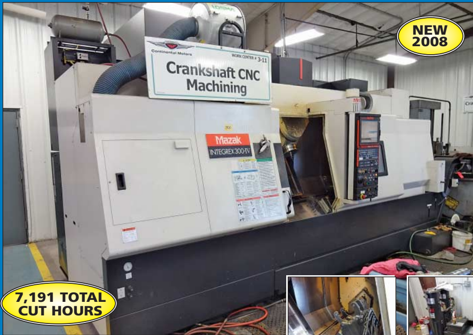
Mazak Model Integrex 300 IV CNC Five-Axis Multi-Tasking Turning Center