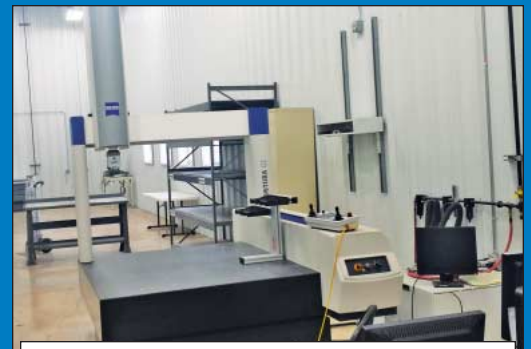
Zeiss Model Contura G2 10.12.6 Coordinate Measuring Machine