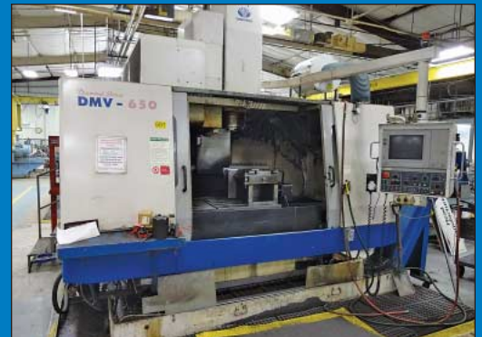
(2) Daewoo Model DMV-650 CNC Vertical Machining Centers