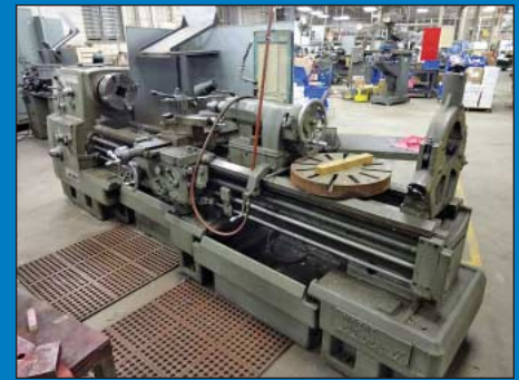
21" X 80" Mazak Geared Head Engine Lathe