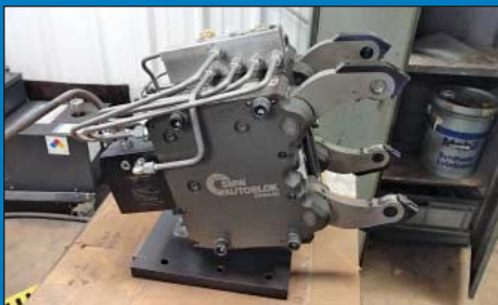
SMW Autoblock Hydraulic Steady Rest