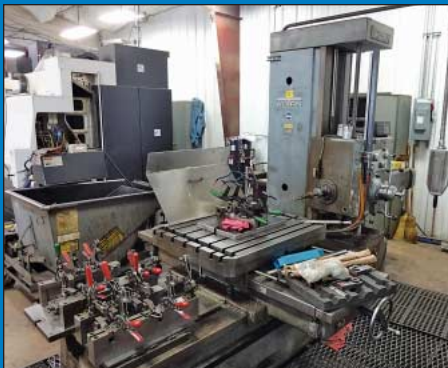
3" Wotan Model B75 Horizontal Boring Mill