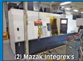
(2) Mazak Integrex's

Contact Information 2020 Dunlap St. Cincinnati, Ohio 45214 Phone 513-241-9701 Fax 513-241-6760 www.cia-auction.com