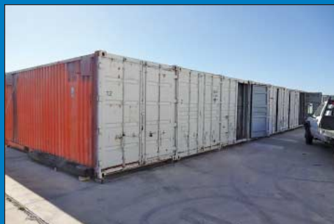
(25) 20' Storage Containers

17" X 60" Sharp Model 1760K Geared Head Engine Lathe; S/N 73277