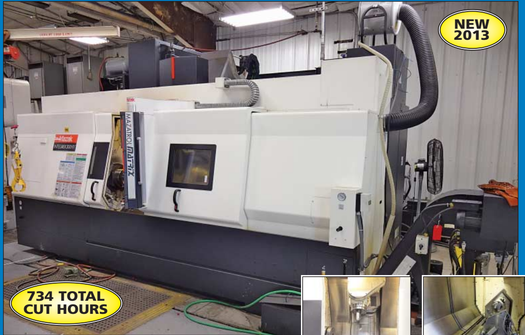
Mazak Model Integrex 300 IV CNC Five-Axis Multi-Tasking Turning Center