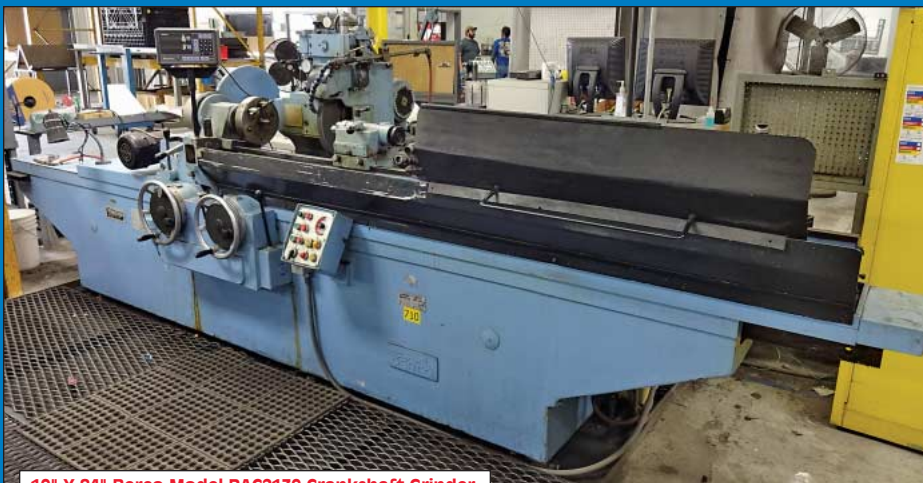
10" X 84" Berco Model RAC2130 Crankshaft Grinder