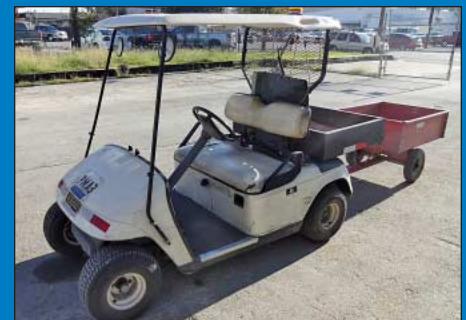
(9) EZ-GO Electric Golf Carts w/ Chargers