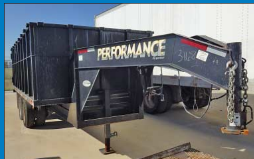
2005 - Parker Trailer Dump Trailer