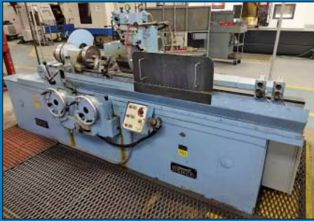
10" X 60" Berco Model RAC Crankshaft Grinder