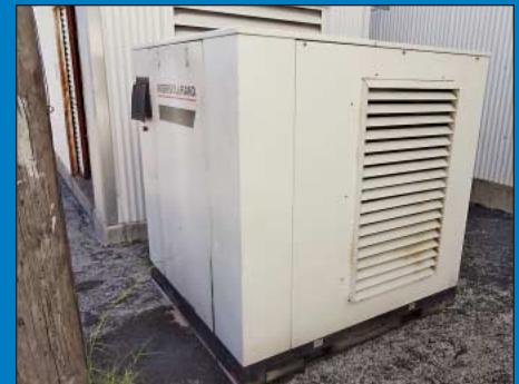
60 HP Ingersoll Rand Model SSR-EP60 Cabinet Enclosed Rotary Screw Air Compressor

14" X 40" Jet Model GH-1440ZX Geared Head Engine Lathe; S/N 05751