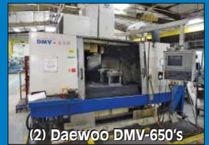
(2) Daewoo DMV-650's