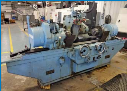
(2) 20" X 60" Berco Model RTM260A Crankshaft Grinders