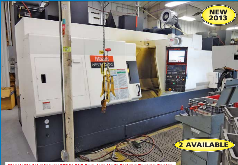
Mazak Model Integrex 300 IV CNC Five-Axis Multi-Tasking Turning Center

INSPECTION: MONDAY, JANUARY 9TH, FROM 10:00 AM TO 4:00 PM