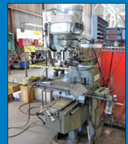
3 HP Comet Vertical Mill w/ DRO