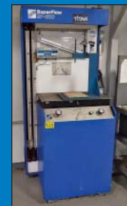
Superflow Model SF-600 Flow Bench

Large Quantity of Office Equipment Including; Desks, File Cabinets, Lateral File Cabinets, Chairs, Office Partitioning, Breakroom Furniture, Lobby Furniture & Related